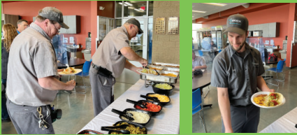
A delicious Taco Bar was enjoyed by all shifts.

Celebration was in abundance at GOEX as we took part in a variety of festivities in honor of all our dedicated employees for National Employee Appreciation Day March 4, 2022.