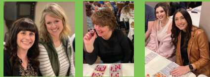
Prizes and comradery abounded at our joint Bingo Night with Prent Corporation.

In addition, Car Wash Tokens and Gas Cards were given out to lucky winners. Thank you every one. We truly appreciate all you do for GOEX!